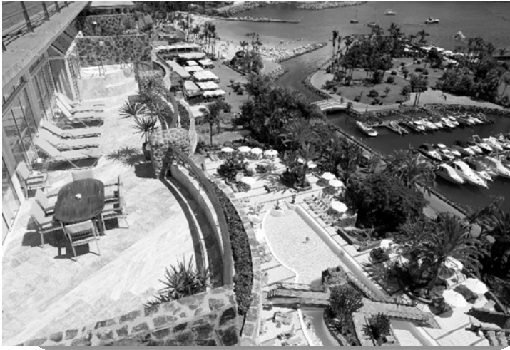
Image 2. Anfi del Mar