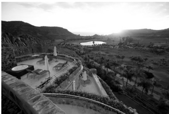
Image 3. Anfi Tauro Golf & Luxury Resort

In addition, the Anfi Tauro Golf & Luxury Resort complex represents the future of the Anfi Group . When its construction is finished, it will offer approximately 7,500 beds in holiday membership complexes, unsubsidized properties and condominium hotels, 12 as well as two golf courses, a white-sand beach, a sports port with 500 moorings and an important set of leisure services and installations (Image 3).